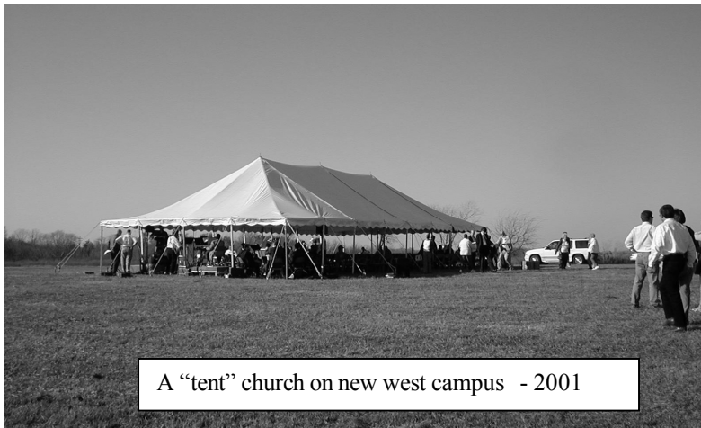
A “tent” church on new west campus - 2001

2001 – Purchase of 67 acres West of Lawrence at a cost of $1,700,000 with $750,000 from the Kansas East Conference