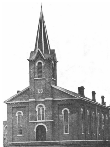
“Brick” Church on Massachusetts

1890 – The brick church on Massachusetts is sold to J. B. Watkins for $5,000. Some stained glass windows from the church are eventually moved to the Watkins Bank (now Watkins Community Museum).