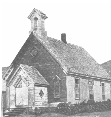
The “Frame” church on Vermont

1858 – A wooden “Frame” church is completed at 724 Vermont at a cost of about $2000. The Church has about a hundred members.